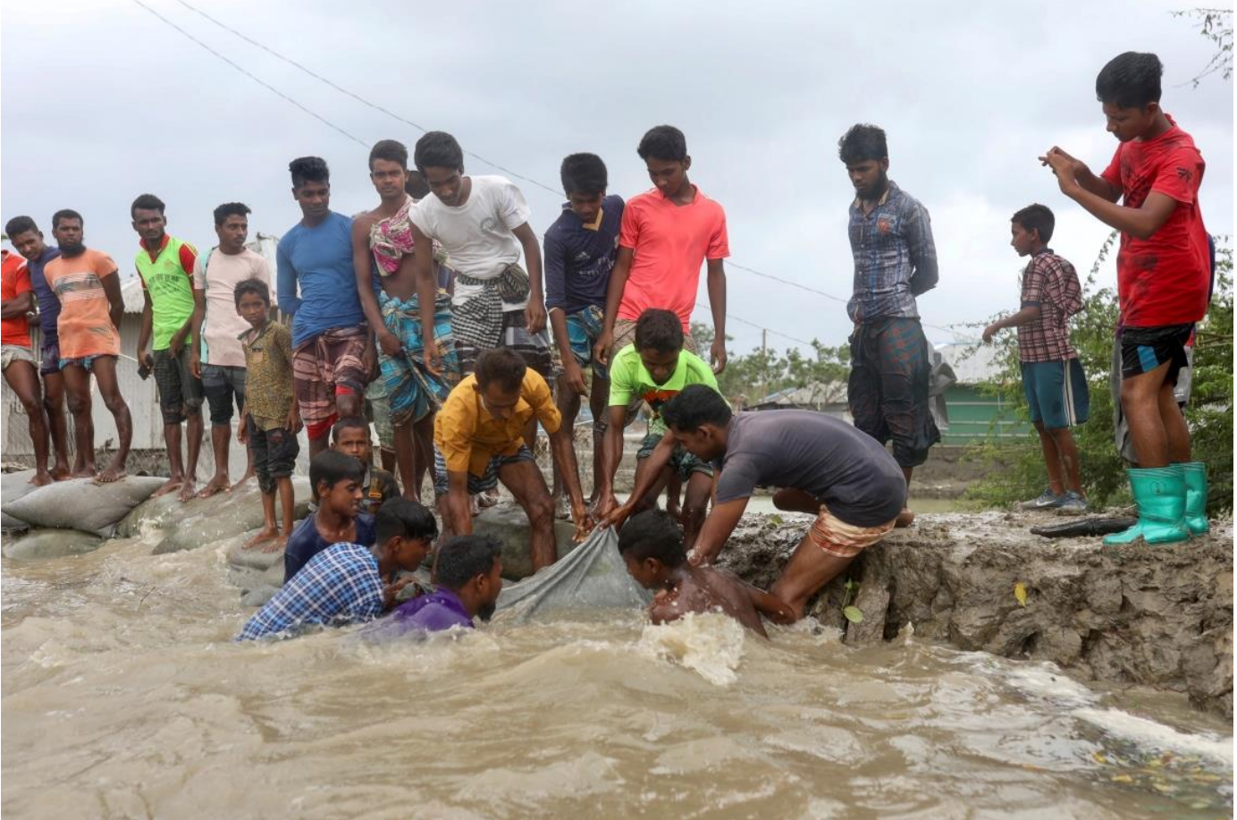
(not ADRA Picture)