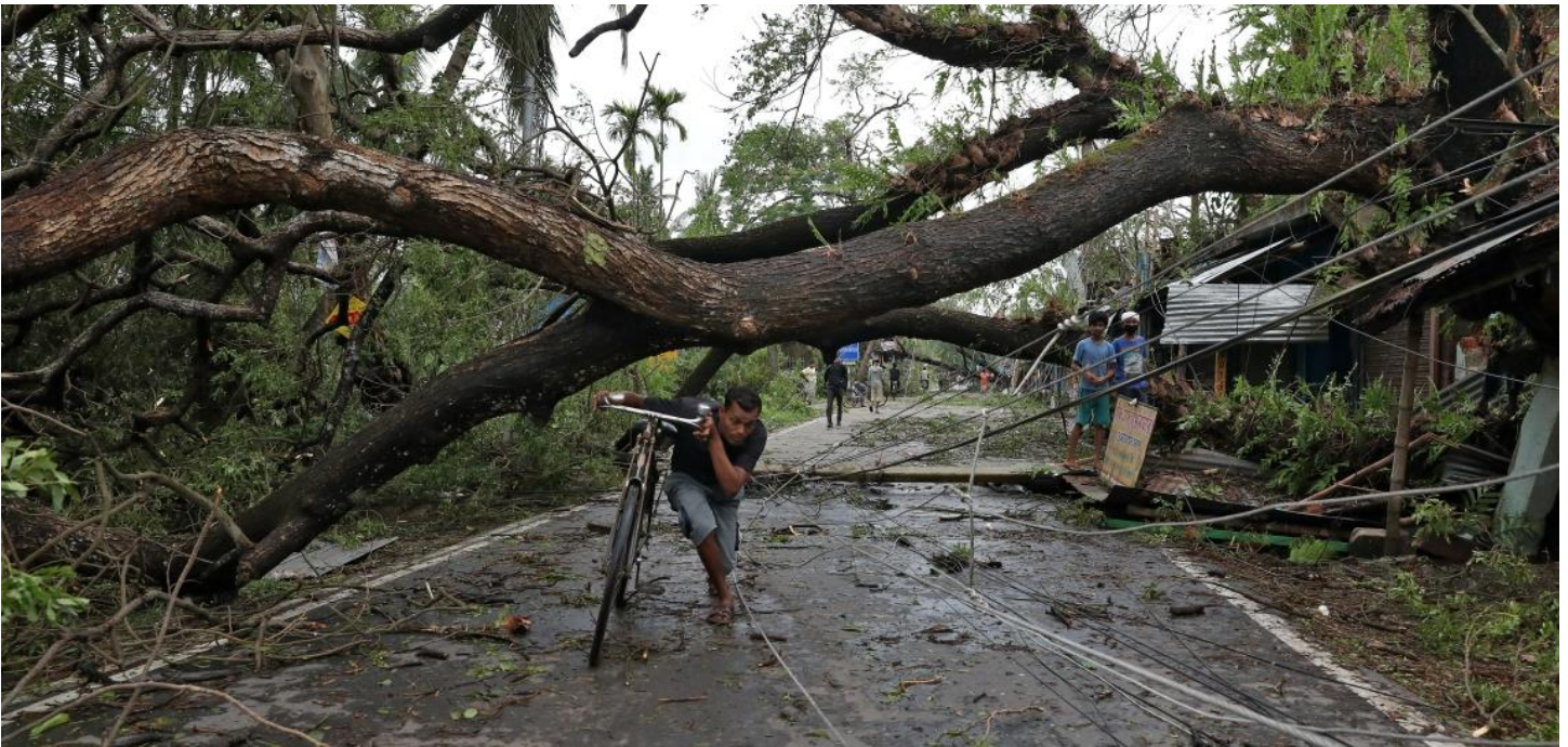
(not ADRA Picture)