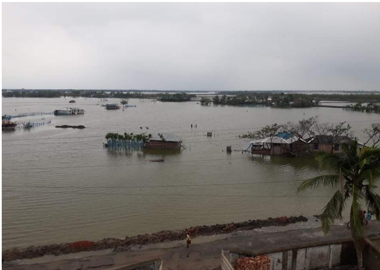
(not ADRA Picture)