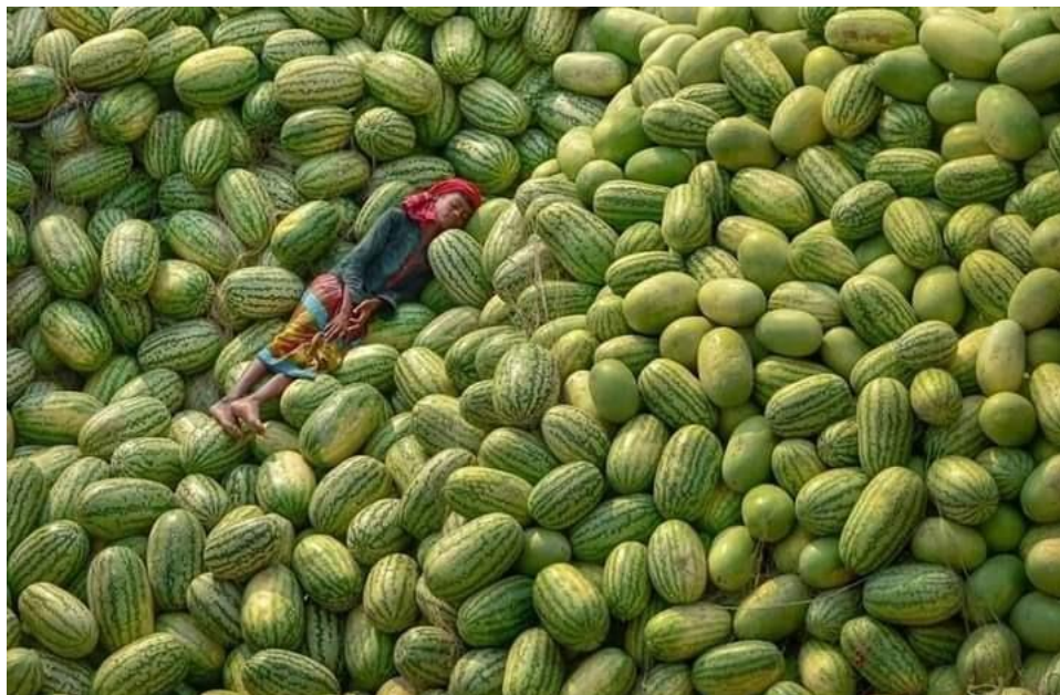
(not ADRA Picture)